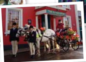
Tring's Own Apple Fayre. Procession setting off from the KA...